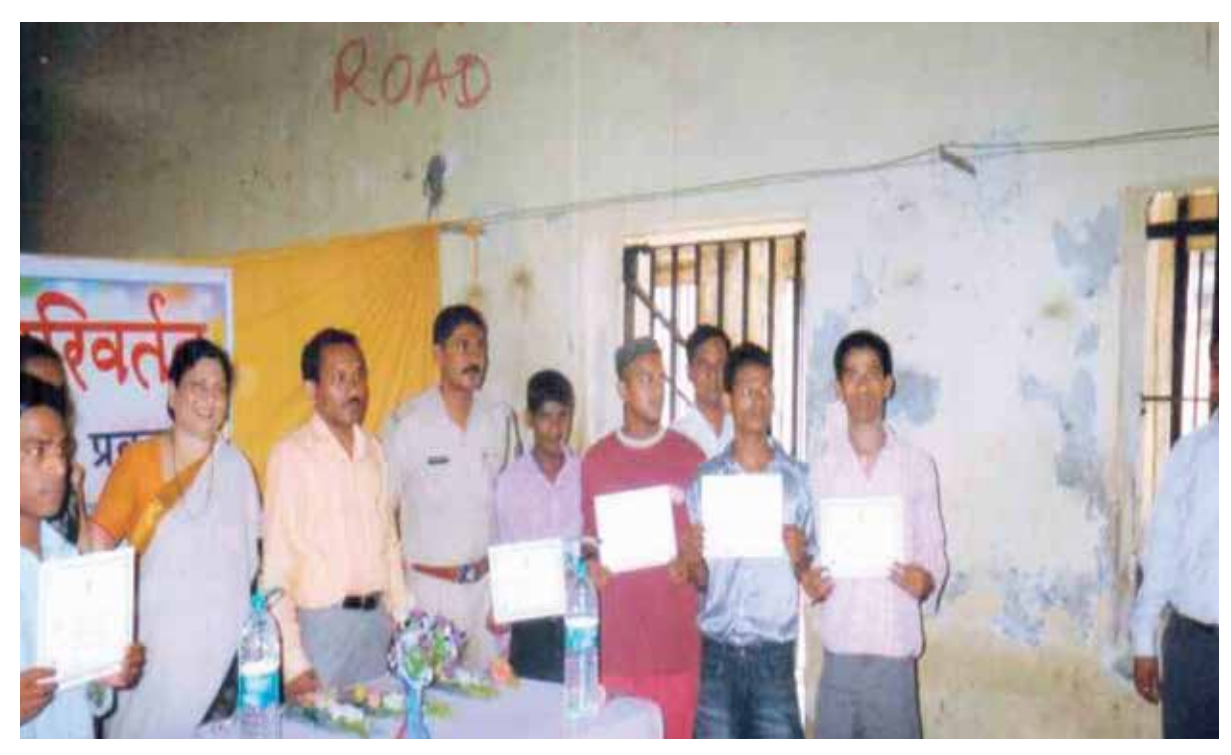
Certificate Distribution Ceremony at Arthur Road Prison

Other activities: Guest Lectures, Hobby Classes, Individual and Group Counselling.